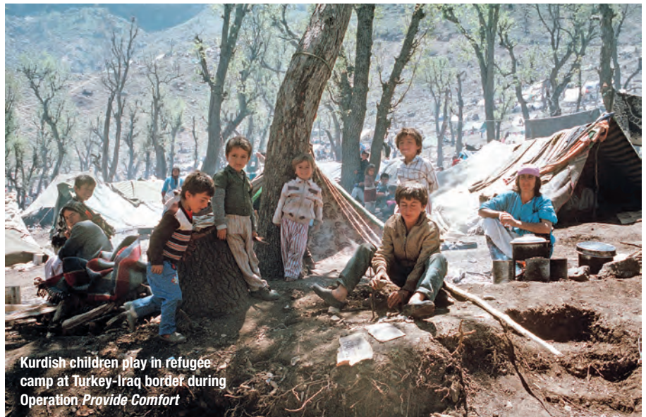
Kurdish children play in refugee camp at Turkey-Iraq border during Operation Provide Comfort

One of General Shalikashvili’s greatest strengths was his ability to manage highly complex missions, particularly those with a major logistical dimension. The basic building block of this skill was the importance he placed on “knowing one’s stuff.” This was a lesson