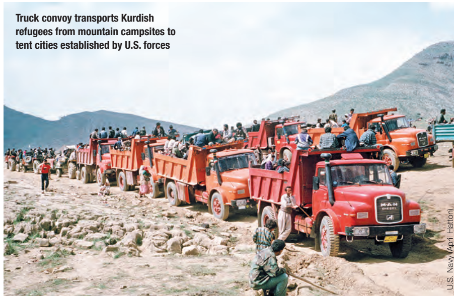
Truck convoy transports Kurdish refugees from mountain campsites to tent cities established by U.S. forces

Powell. Laterally, USAREUR was responsible for much of the day-to-day planning and providing the bulk of the logistical support. Down the chain of command were the men and women of the operation, who would come to number more than 35,000 troops from 13 countries. The military contingent would also work in close cooperation with volunteers from more than 50 NGOs, as well as with Turkish government officials and citizens.