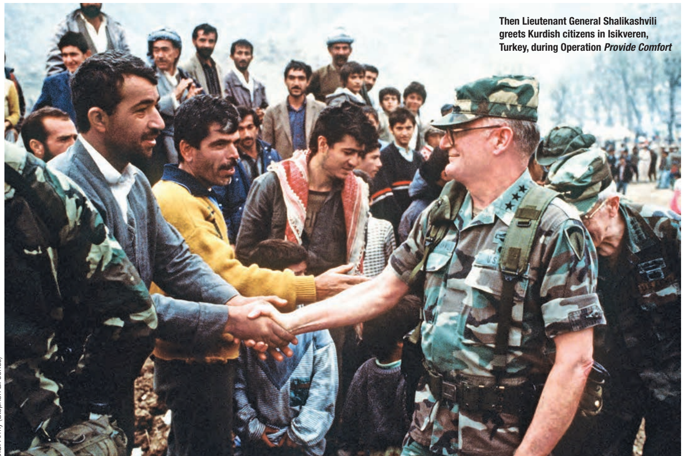
Then Lieutenant General Shalikashvili greets Kurdish citizens in Isikveren, Turkey, during Operation Provide Comfort

what catapulted General Shalikashvili to this pinnacle of leadership was his stellar command of Operation Provide Comfort