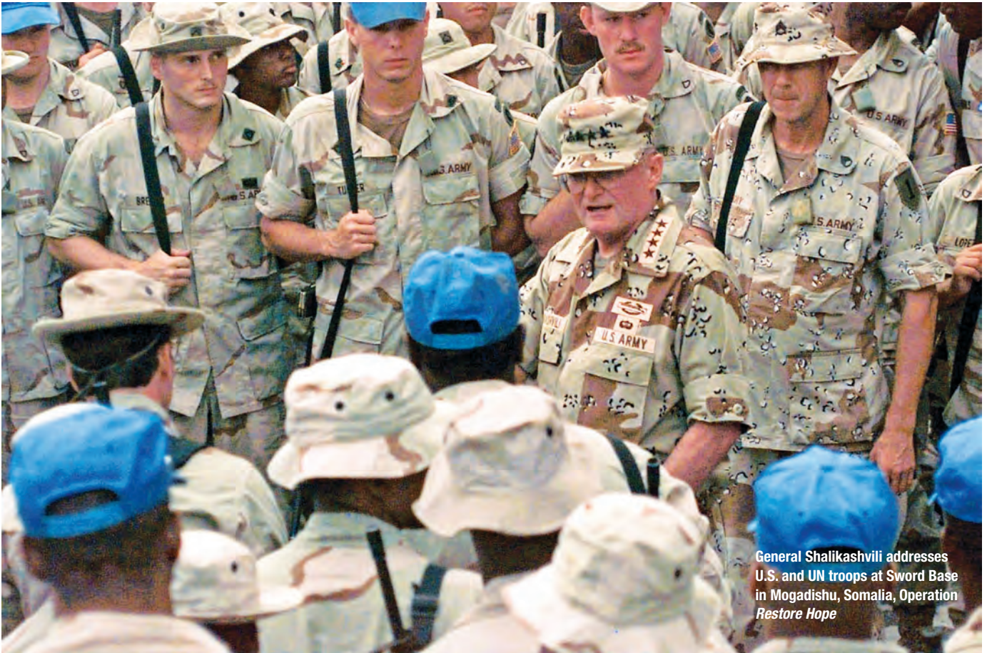
General Shalikashvili addresses U.S. and UN troops at Sword Base in Mogadishu, Somalia, Operation Restore Hope