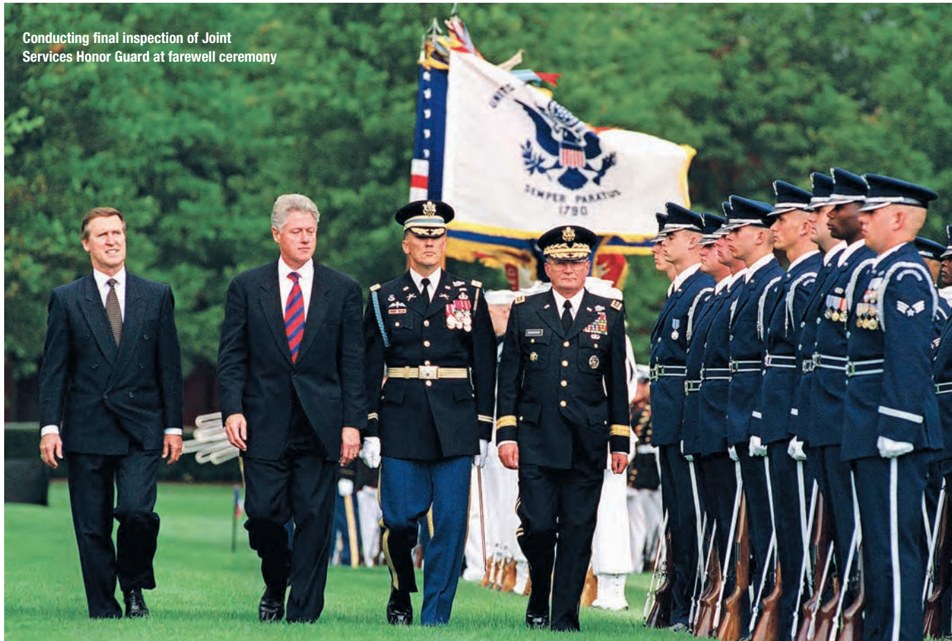
Conducting final inspection of Joint Services Honor Guard at farewell ceremony

despite Shalikashvili's efforts to avoid the spotlight, his enthusiasm for rescuing these needy refugees would be recognized