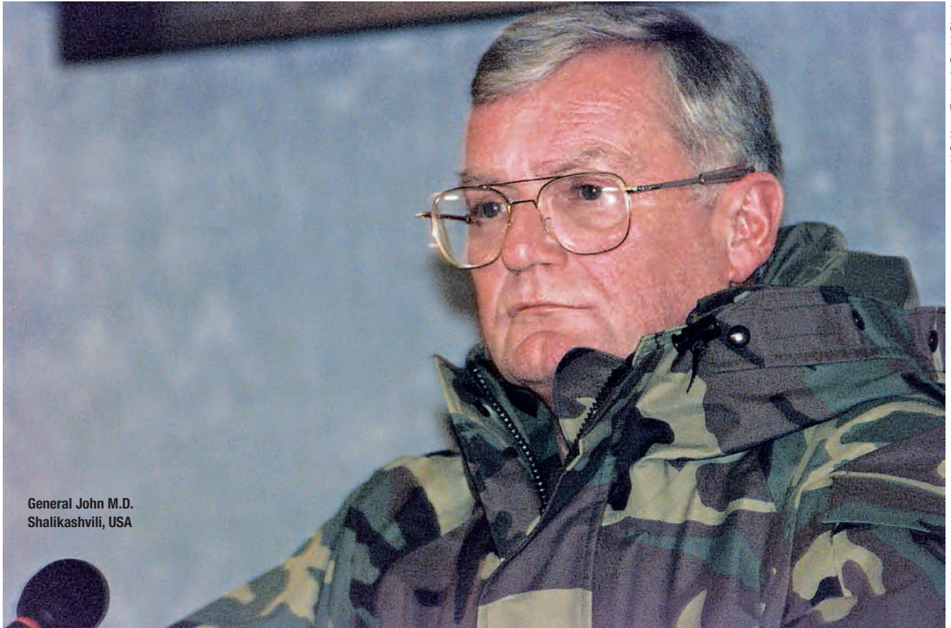
U.S. Navy (Benjamin David Olvey)